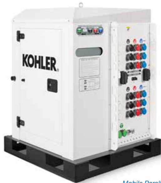
Mobile Paralleling Box

KOHLER mobile generators with propane engines offer a 15%-20% reduction in hourly fuel costs. †