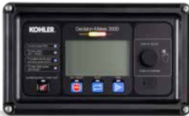
3500 - available on mobile generators only